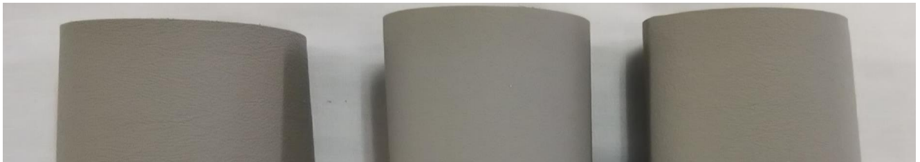
Only Leather fabric